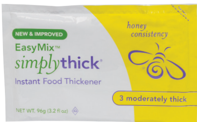
96g Honey (Level 3 Moderately Thick) packet