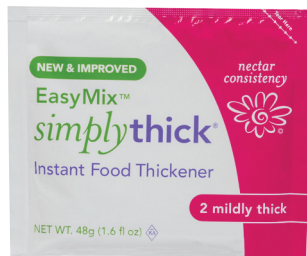
48g Nectar (Level 2 Mildly Thick) packet

SimplyThick's pre-measured packets allow for fast and easy preparation of beverages anywhere. Each packet produces either Nectar (Level 2 Mildly Thick) or Honey (Level 3 Moderately Thick) consistency. Two Honey packets produce Pudding (Level 4 Extremely Thick) consistency.